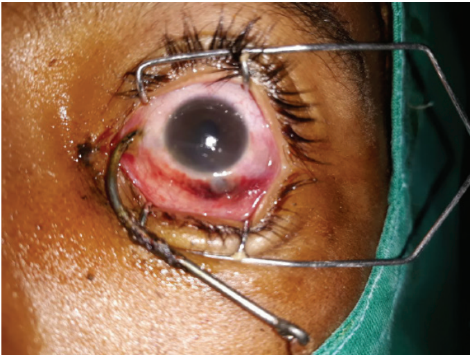
Fig. 1. Photograph showing the barbed fish hook penetrating the limbus at 9 o'clock position and exit point seen at 6 o'clock position.

We got a clearance from the anaesthetist and took up the child for removal of the fish hook and primary repair under general anaesthesia. A peritomy was done and wound explored, and in view of the arrowhead-shaped hook, it was decided to pull the hook out through the exit wound to prevent ripping up of the tissues by the arrow head. As the hook was lodged in the ciliary body zone,