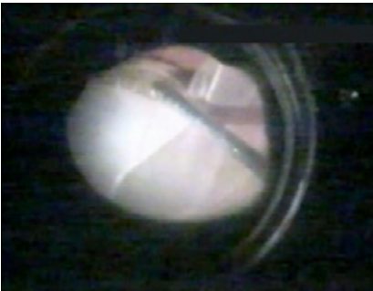
Fig. 3. Crystalline lens being maneuvered through the giant retinal tear.