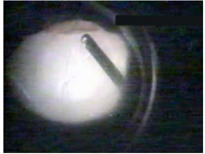
Fig. 2. Subretinal crystalline lens as seen through the inferior retinal detachment with giant retinal tear.

of the crystalline lens was confirmed (Fig. 2). The lens was maneuvered through the giant retinal tear (Fig. 3) using the suction of the vitrector and endoilluminator, into the vitreous cavity (Fig. 4) and appropriately managed. The retina was reattached. At three months follow up, the patient's vision was 20/200 and the retina remained attached.