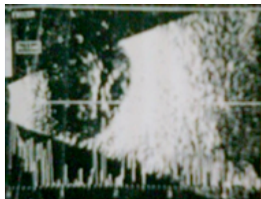
Fig. 1. B-scan ultrasound image showing the subretinal location of the lens

A three port pars plana vitrectomy under local anesthesia was performed. A subtotal retinal detachment was noted sparing the macula with a giant retinal tear inferiorly. The subretinal location