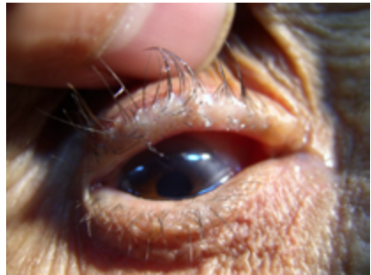
Fig. 1. Severe lid margin abnormality in patients with trichomatous entropion.

Tarsal plate consistency was categorized considering the presence or absence of tarsal shrinkage (shortening with or without thickening) or loosening (loss of tarsal consistency) or both.