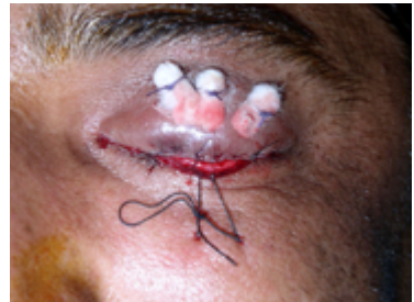
Fig. 4. Anterior lamellar recession with fornix suture and fixing traction suture.

We agree with Sodhi 6 that recurrence of trichitic lashes is due to gradual downward sliding of recessed anterior lamella, so placement of a fornix suture and tarsal traction sutures may stable the anterior lamella in a recessed position and improve the success of ALR (Fig. 4) As previously mentioned, with this modified techniques the success rate (no