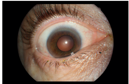
Fig. 4. Complete resolution (4 months).