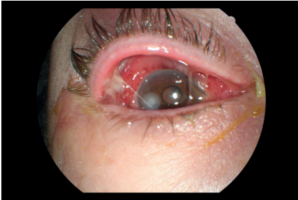
Fig. 1. Anterior segment photograph of the patient's right eye on presentation with intense conjunctival hyperaemia, chemosis and mucopurulent discharge apparent (day 1).