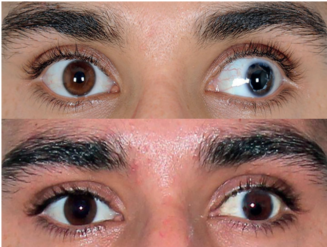
Fig. 1. Photographs of the 23-year-old patient who sustained severe penetrating trauma of the left eye with a consecutive loss of the lens and iris and multiple eye surgeries, before (up) and after (down) ArtificialIris implantation (HumanOptics, Erlangen, Germany) without previous Artisan lens exchange. The pupil is well centered and the color matches the fellow right eye. Even though the match between the two eyes may not be perfect in every case, from cocktail party distance it is very difficult to see any difference between the two eyes.

In February 2014, a 23-year-old man presented with photophobia and a history of eye trauma (penetration) 10 years earlier. "I can't communicate with my friends or participate in social activities because people stare at my disfigured eye," he said (Figs. 1 and 2). He was upset about his appearance and was unable to maintain eye contact comfortably, even with me. He was not satisfied with conservative management techniques (spectacles or contact lenses) or suturing the natural iris (via iridoplasty, iridopexy, or side-to-side iris sutures). The patient was advised to ignore his condition and focus on more positive things (exercise, listening to music and other similar activities). The patient signed and received a copy of the written informed consent document that explained probable treatment complications, such as glaucoma, corneal decomposition and consecutive surgeries. A customized ArtificialIris was ordered based on the patient's face, focusing on the color of his normal eye. In this case, an ArtificialIris with a fiber meshwork was ordered for its reliability. A second ArtificialIris was also requested as a backup.