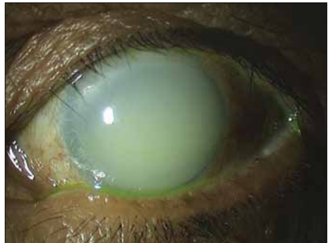
Figure 1. Total white hypopyon in a non-inflamed eye.

28 mm Hg in the right eye and 48 mm Hg in the left eye. B-scan ultrasonography showed no evidence of vitreous opacity, retinal detachment, or choroidal mass in the left eye. The right eye was pseudophakic.