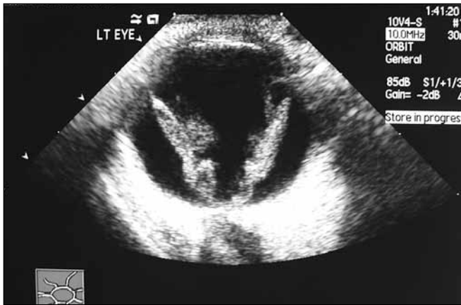
Figure 1. A funnel-shaped retinal detachment attached to the firm anchoring points of the ora serrata anteriorly and the optic nerve head posteriorly.