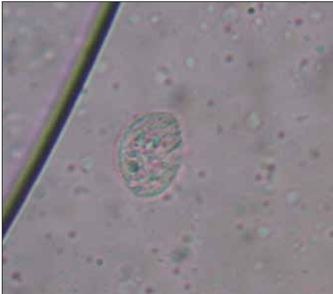
Figure 2. Trophozoite in a normal saline wet-mount preparation of corneal scraping (original magnification, x 400).