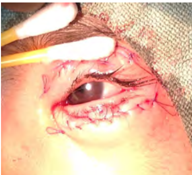
Fig. 3. Close-up image showing corrected both lids entropion on table.