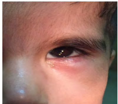
Fig. 4. Postoperative follow up after three months