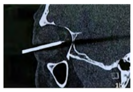
Fig 1b. CT scan showing a perforating industrial nail injury with a true antero-posterior course through the right eye.

Two weeks after the primary repair, he underwent a pars plana vitrectomy (PPV) with endophotocoagulation and cyclopropane gas tamponade for repair of the vitreous incarceration at the posterior exit wound site. Despite the gas tamponade, two weeks after the second surgery, he developed an inferior retinal detachment extending from the perforation site. He subsequently underwent additional laser retinopexy and silicone oil tamponade.