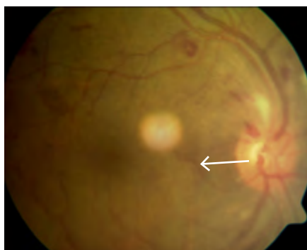
Fig 2. Right eye of patient multiple retinal haemorrhages in all the quadrants with pre retinal haemorrhage in the inferotemporal area

comprehensive investigations failed to reveal any another underlying etiology (This include CBC,CT,BT,INR,Homocysteine level,protein C and S, Antithrombin III and factor V level).In the mean time he was also evaluated by ENT specialist where the diagnosis of moderate conductive hearing loss was made. Patient was subjected to CT scan to find out the cause of hearing loss. CT scan revealed opacification of the mastoid air cells consistent with hemorrhagic effusion with no fracture of bone. After three weeks of follow up the pre retinal haemorrhage was completely resolved and retinal haemorrhage was decreased in number (Figure 3).His visual acuity was improved to 6/12/ N/8 RE. Our patient did not suffer from any skin or eye lid burns.