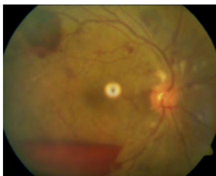
Fig 3. resolving haemorrhage